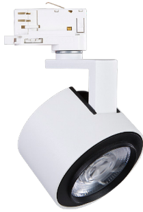
TS8259 Track Spotlight

Input Voltage 220-240VAC Multivoltage / 50-60Hz Light Power 10W Luminous flux ~900lm Light Source COB Citizen CCT 2700K, 3000K, 4000K CRI >80 CRI90, CRI97 as an option Diffuser Lens+Reflector Beam Angle Reflector 15°, 24°, 36° Driver Built-in Operating Temperature -25°C~+50°