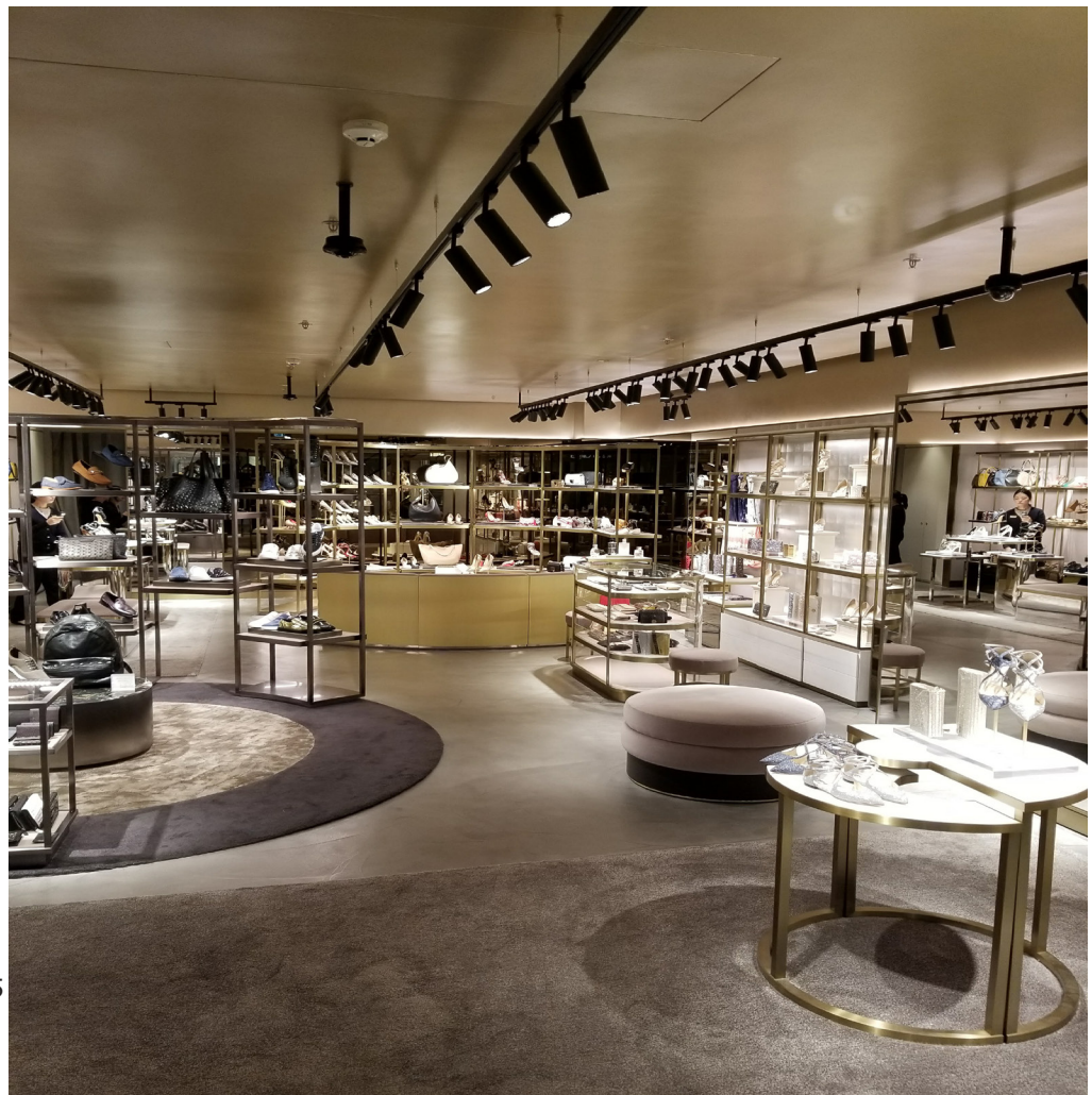
Track Spot light, series Hoff reference TS85165 35W, ~3150lm

Input Voltage 220-240VAC Multivoltage / 50-60Hz Light Power 20W Luminous flux ~1800lm Light Source COB Citizen CCT 2700K, 3000K, 4000K CRI >80 CRI90, CRI97 as an option Diffuser Lens+Reflector Beam Angle Reflector 15°, 24°, 36° Driver Built-in Operating Temperature -25°C~+50°